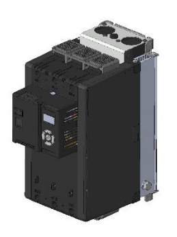
Step 4. Remove the blanking plug and insert the flying lead from the fan assembly into the socket as indicated below.

Step 3. When the fan assembly is fully home and the lower plate of the assembly has engaged with the lower mounting screws, re-tighten the mounting screws fully.